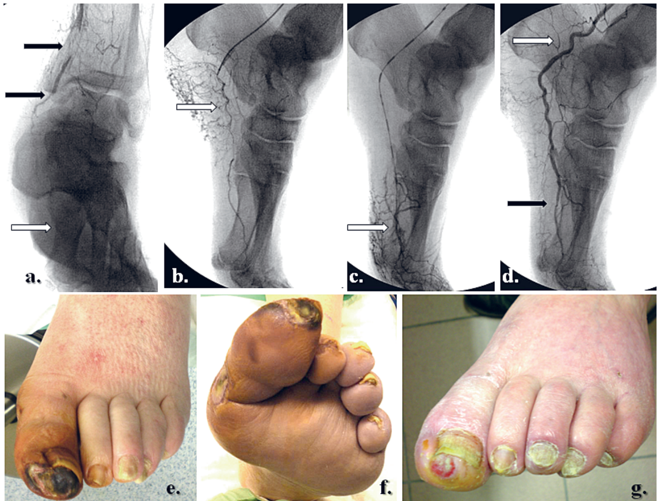
Fig. 2. Selective revascularization of the posterior tibial and medial plantar artery and consequent flow reperfusion in the medial plantar angiosome.