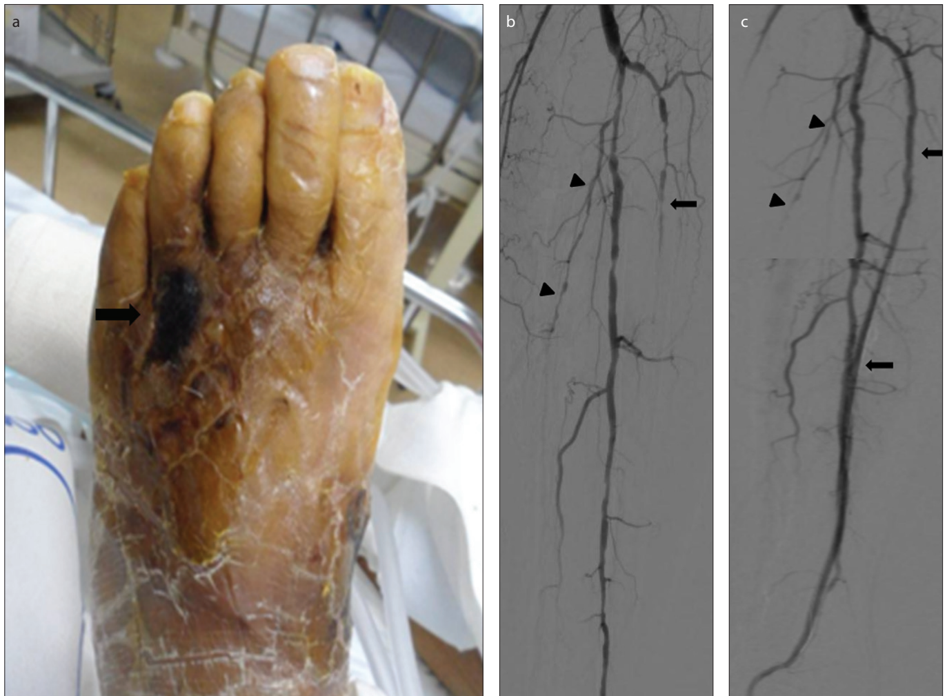
Figure 1. a–c. A 70-year-old female diabetes patient with a nonhealing wound on the dorsum of her left foot. Photograph of the left foot (a) shows a 2×3 cm focal gangrenous wound on the dorsal surface of the left foot (arrow). According to the angiosome concept, the anterior tibial artery is considered the target artery. Initial angiography (b) shows total occlusion of the left anterior tibial artery (arrow), the left posterior tibial artery (arrowheads), and multifocal stenosis of the left peroneal artery. Completion angiography (c) after infrapopliteal percutaneous transluminal angioplasty shows complete recanalization of the left anterior tibial artery (arrows), the left peroneal artery with a normalized luminal diameter, and the non-recanalized state of the left posterior tibial artery (arrowheads), with a technical success score of 3 points. The wound fully recovered within five weeks of angioplasty (not shown).

tients died after complete wound healing during the two-year study period.